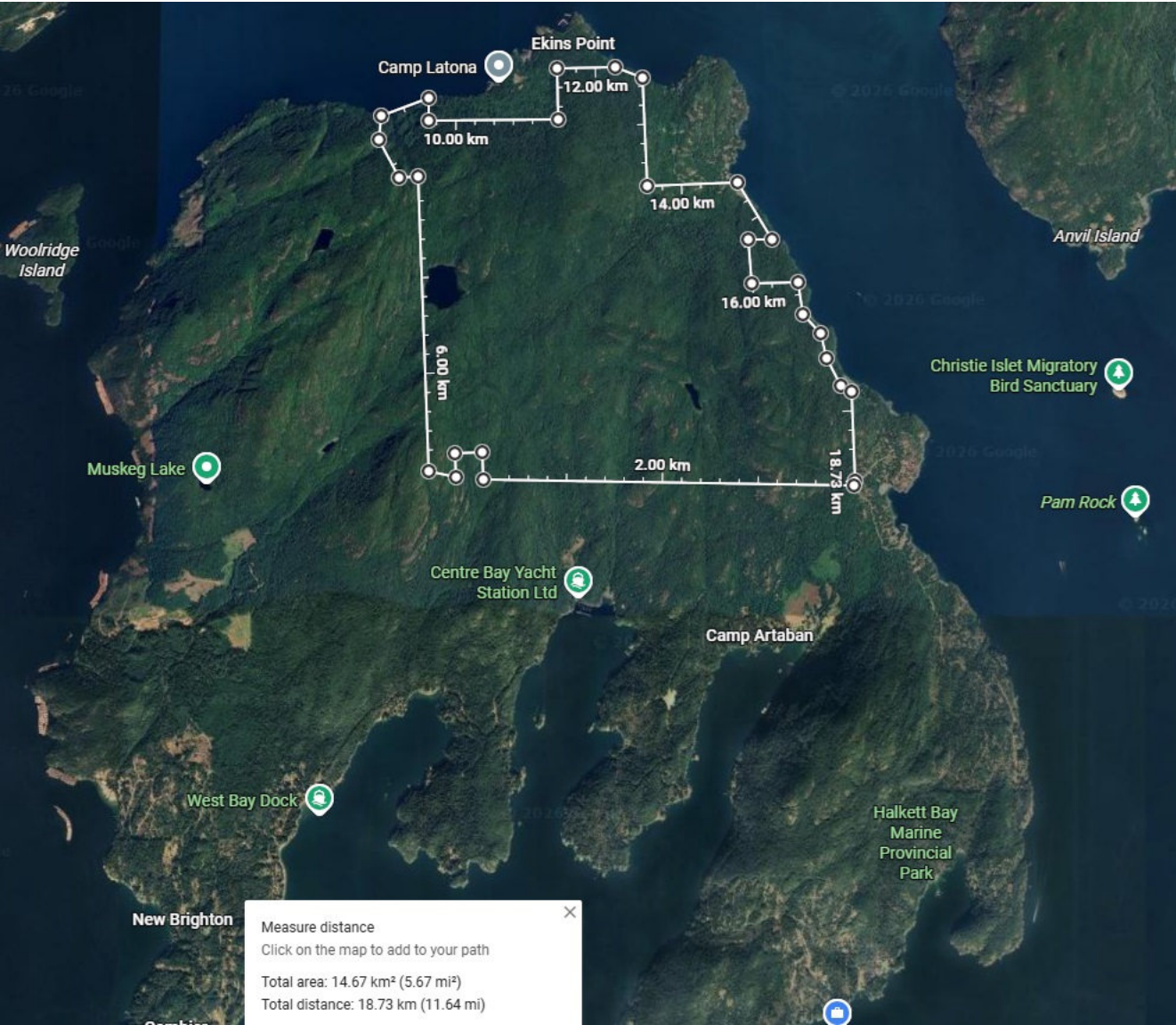
Squamish Nation Cultural Site area estimate map.jpg