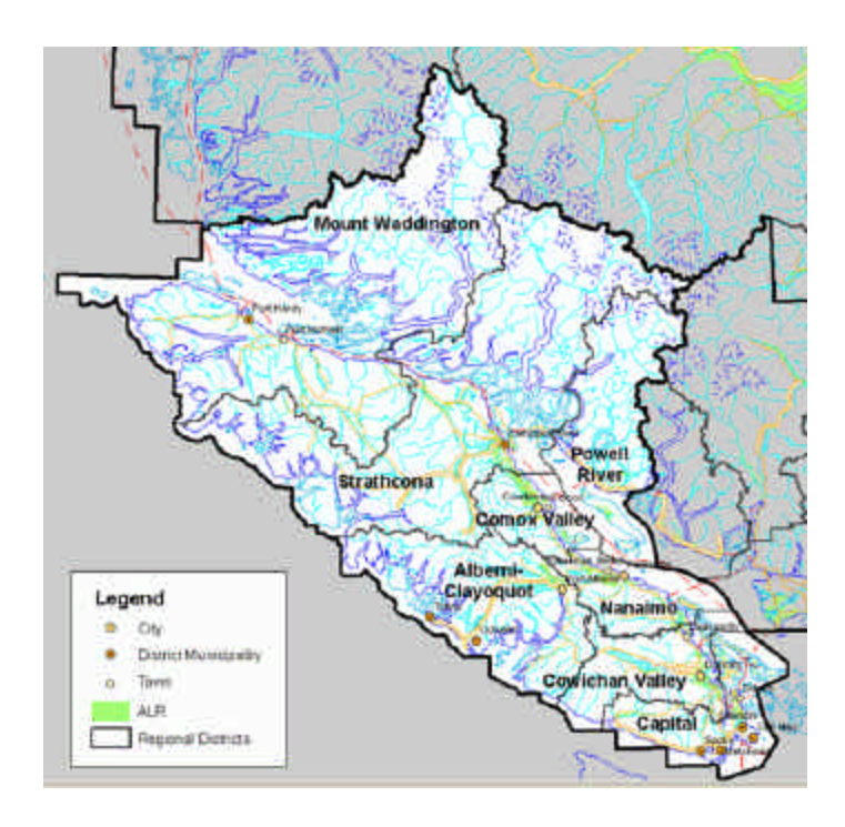
Figure 2. ALC Island Panel Region Area of Panel Region: 7,786,900 hectares Area in ALR: 115,496 hectares <a href="http://www.alc.gov.bc.ca/publications/Annual_Report_2009/2.2.html">http://www.alc.gov.bc.ca/publications/Annual_Report_2009/2.2.html</a>.