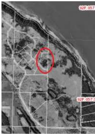
2002 Orthophoto – Neighbourhood

The 3Ravens property was heavily logged in the late 1990s, as was most of northern Denman Island. This particular property was the largest, and the least logged of the R2 properties in the Parklands Phase 1 Development, with about 33% coverage of older growth (about 60+ years old). See below for the two related orthophotos from 2002. The property's driveways reused old logging roads, recently logged areas, and clearings as much as possible, minimizing any unnecessary disturbance of the recovering ecosystem.