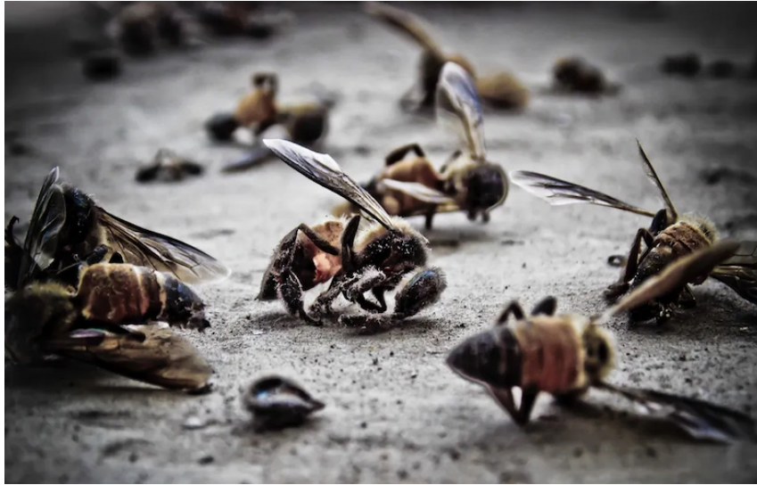
Hundreds of bees drop dead around 5G towers in California

During controlled trials in Switzerland, bees reacted to mobile-phone signals with high-pitched ‘piping’ cues to desert the hive. (Appendix 1.) Beehives exposed for just ten minutes to 900MHz frequencies fell victim to colony collapse disorder.