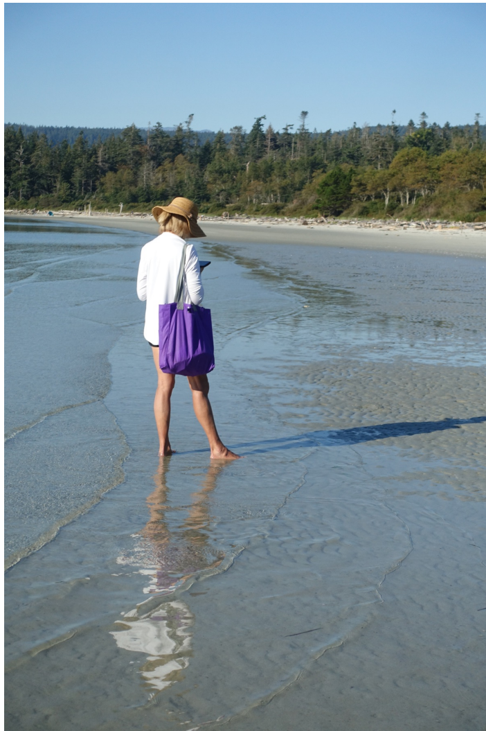
This Hornby visitor finds good cell coverage on Big Trib

Special thanks to West Coast Environmental Law, the Dove Creek resistance and Vancouver Island Safe Tech Alliance for their contributions to this report.