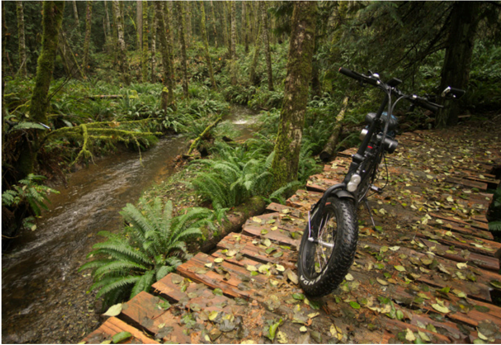
Mt. Geoffrey Provincial Park attracts international visitors

If 4G is proving increasingly problematic, the reckless rush to 5G promises catastrophe. Soon after Nanaimo became “the first city in Canada to receive Rogers Communications’ new 3500 MHz 5G cellular system” last June, some residents began suffering nose bleeds and other EMF-related health problems from untested millimeter waves. The DailyMail reports that high-band 5G frequencies “may affect the eyes, the testes, the skin, the peripheral nervous system, and sweat glands.”