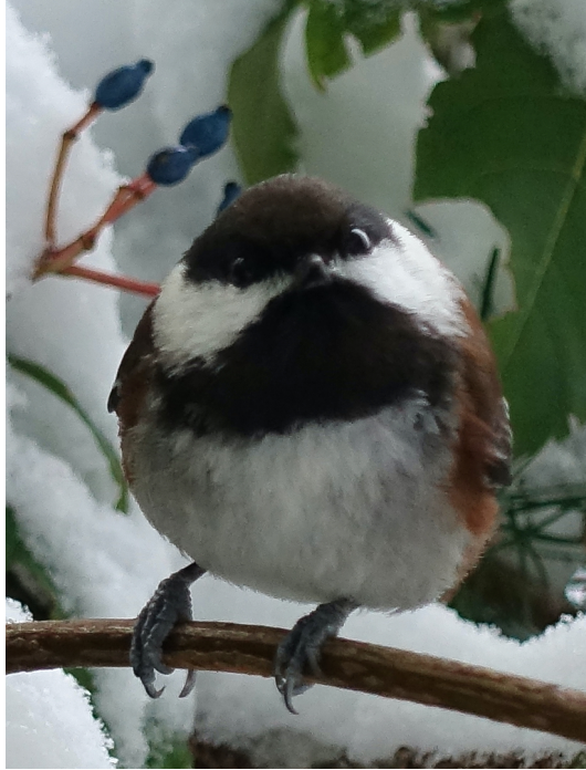
Please don't hurt me

What about our birds and bees? Worldwide, 1 of every 8 bird species is facing extinction . The number of birds in Canada and the United States has declined by 29% — 3 billion birds — over the past half-century. Studies painstakingly ignored by the telcos have found that a cell tower smorgasbord of “ resonant (piggybacking) frequencies may result in biological effects at very low intensities. ”