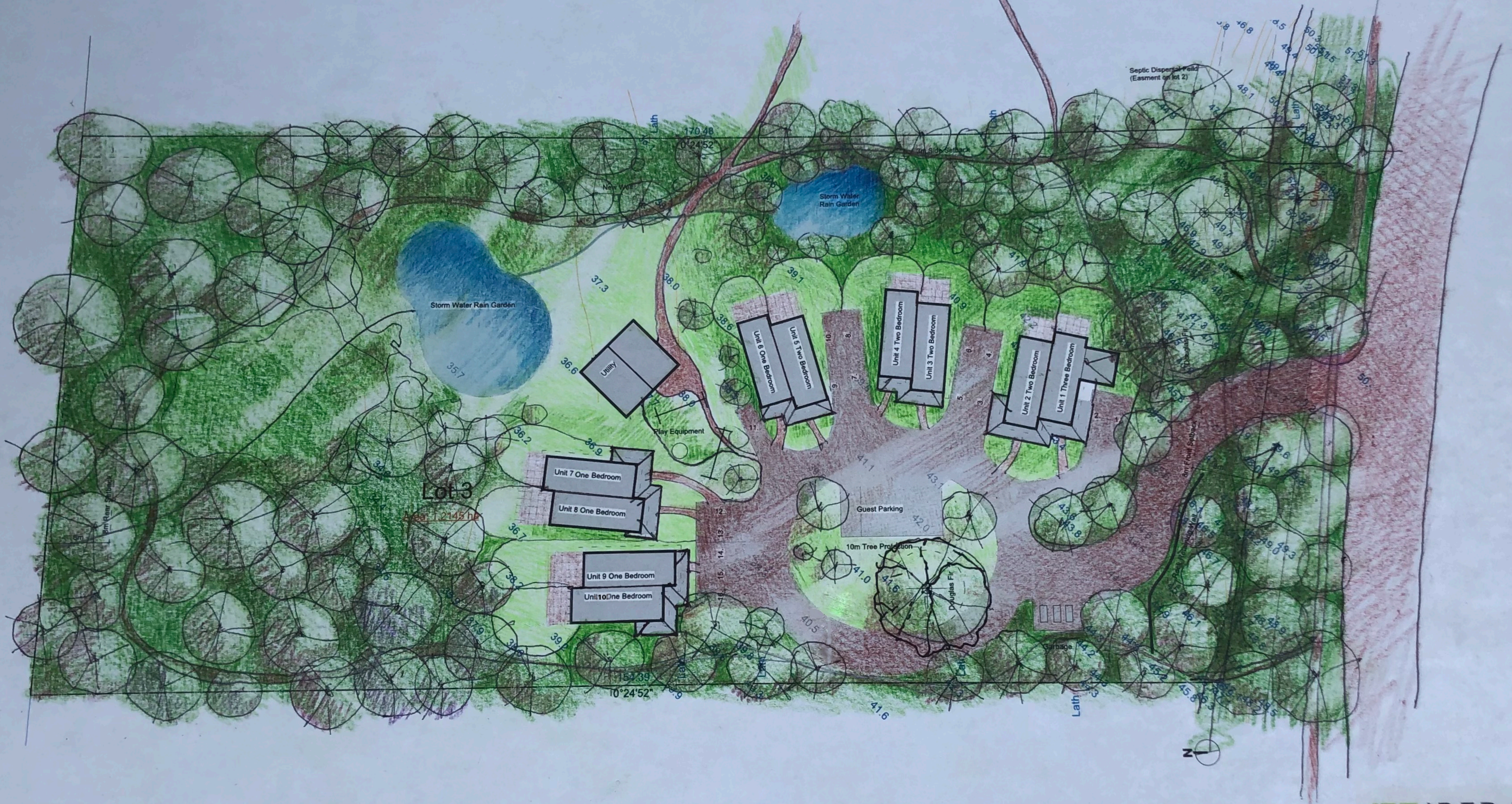
1 Site Plan Scale: Actual Size

375 Village Bay Road, Mayne Island BC | February 2021 10 Unit Affordable Housing | Rezoning and Development Permit Application