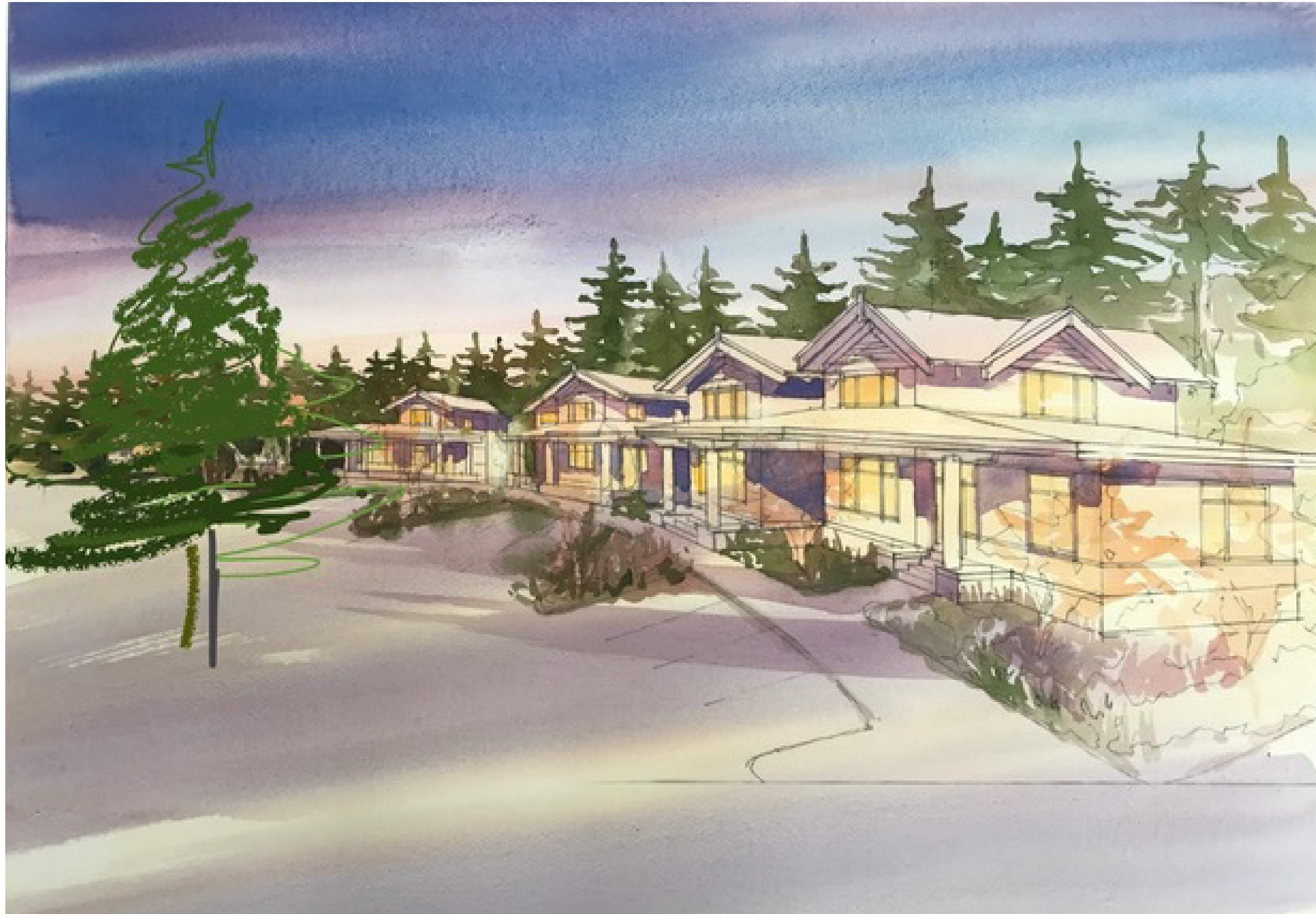
1 Aerial Site Sketch Scale: Actual Size

10 Unit Affordable Housing | Rezoning and Development Permit Application