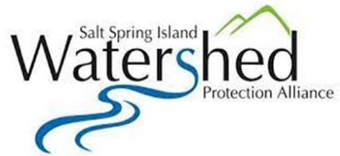
Figure 2: SSIWPA Wordmark and Logo

In this discussion, it is important to understand that a brand is more than an organization's logo. A brand does include logos, but it also includes all the tangibles and intangibles that represent an organization. From the organization's perspective, a brand encompasses the positioning, messaging, communications, visual design, voice, promotions, and presence. From the audience's perspective, a brand is the organization's reputation, how the business makes them feel, what their experience is like with the organization, and what they think of it (Bourne, 2021).